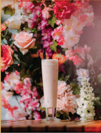
Pretty In Pink