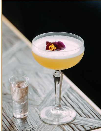
Dip Me In Caramel